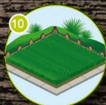
Enjoy Your New Luscious Artificial Turf