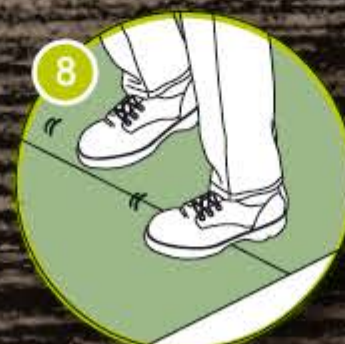
Step On The Seams & Edges To Ensure They Are Stuck Down To The Adhesive Tape.