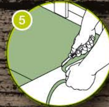
Trim The Edges