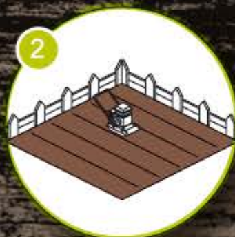
Compact The Soil / Ground