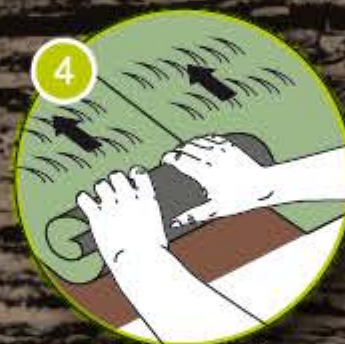
Keep The Yarn Direction Consistent