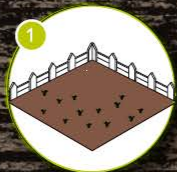
Remove The Weeds