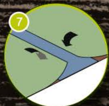
Place The Edges Back Down So The Two Seams Join Together As Closely As Possible