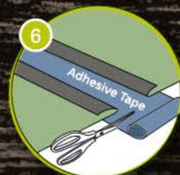
Position Adhesive Joining Tape Beneath Adjoining Edges (Adhesive Side Up)